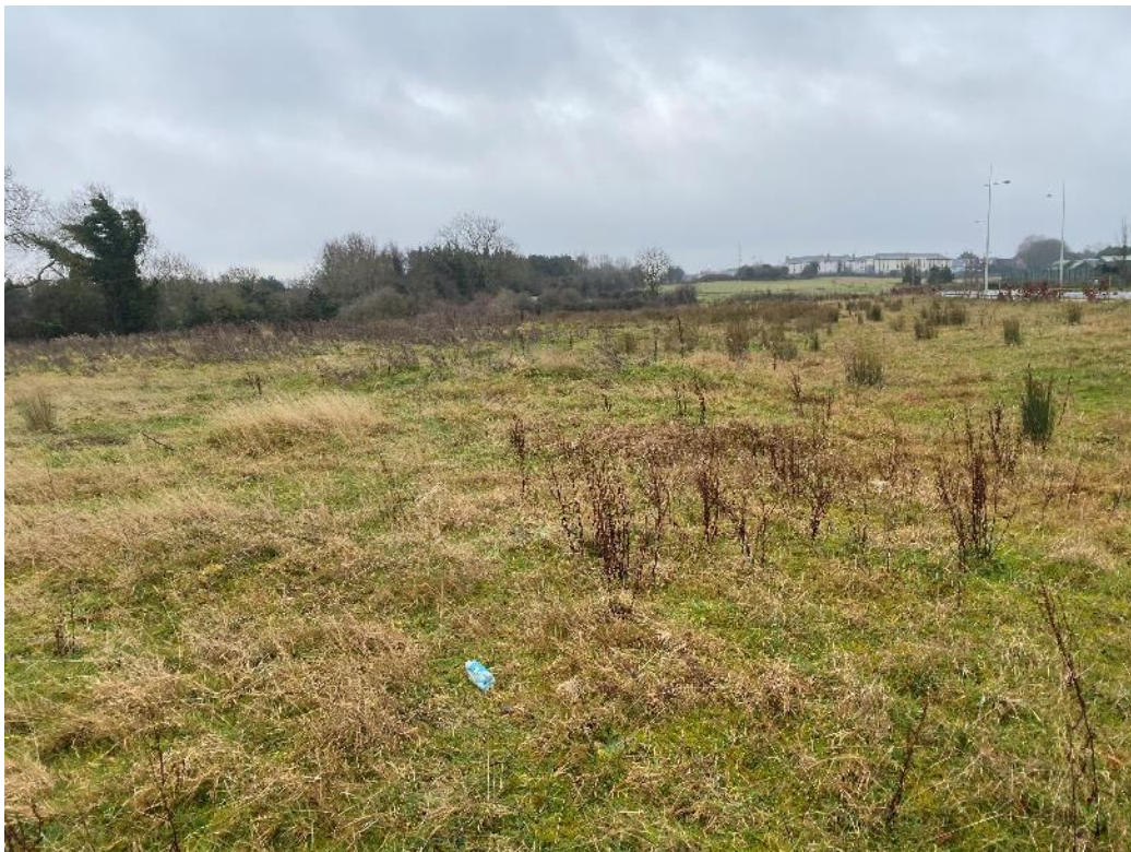
Plate 133-2: Proposed compound area, facing south-southeast