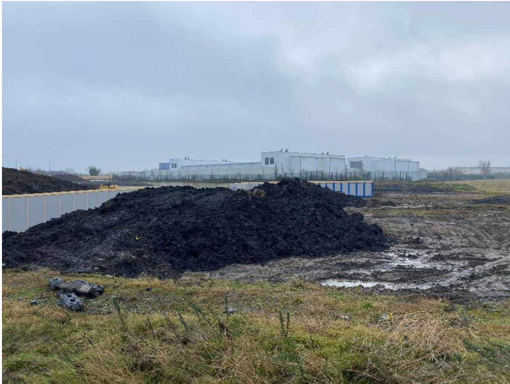
Plate 133-1: Proposed development area, facing southwest