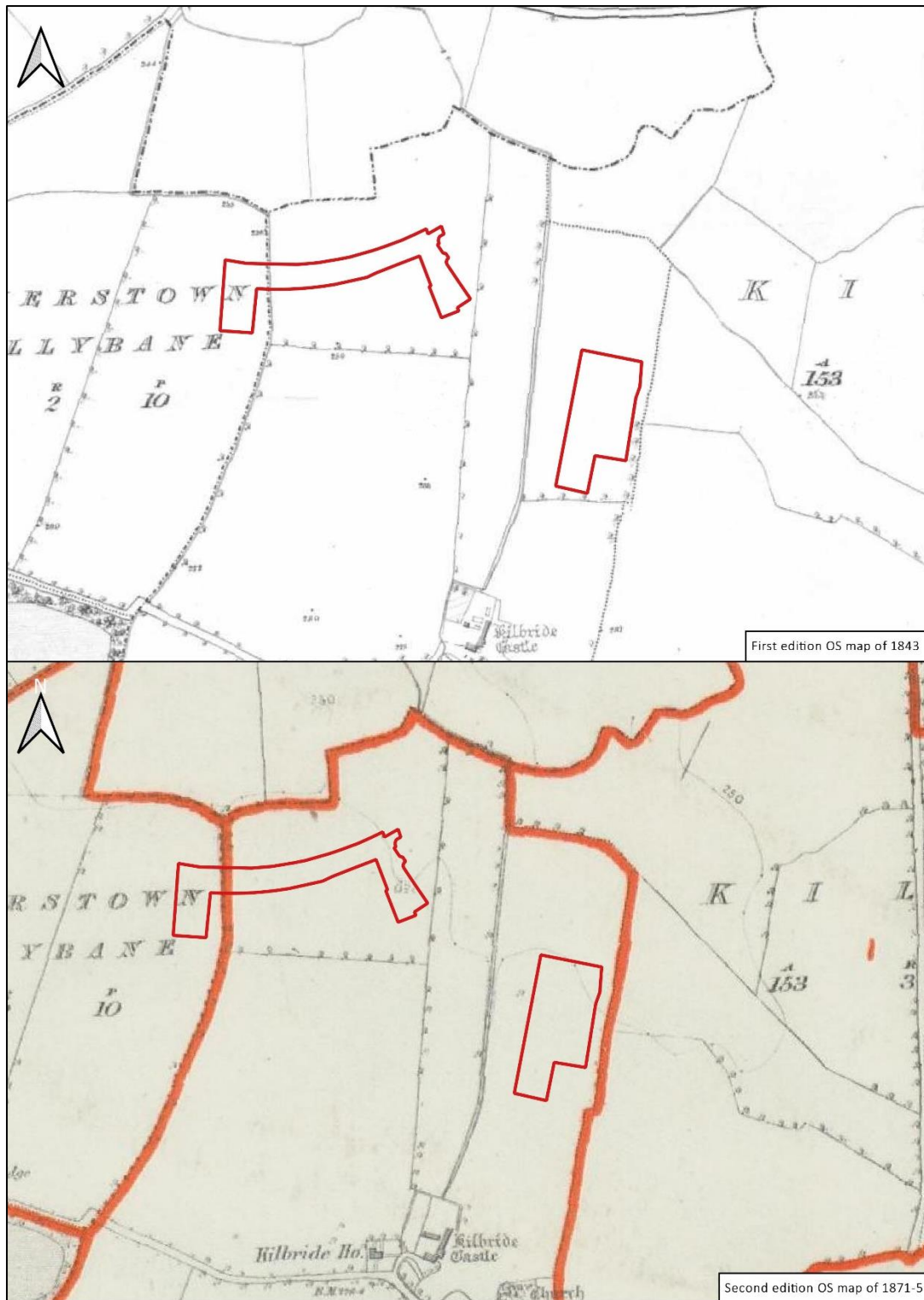
Figure 133-4: Extracts from historic OS maps (1843 and 1871-5) showing the proposed development area