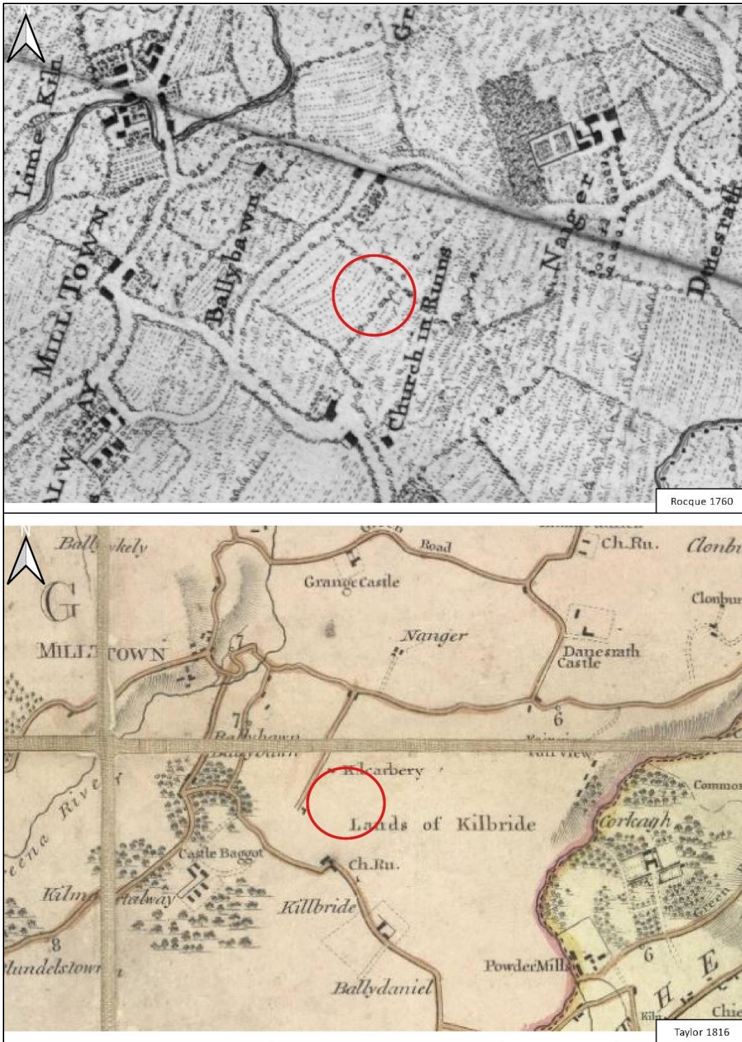
Figure 133-3: Extracts from historic maps (1760 and 1816) showing the approximate location of the proposed development area