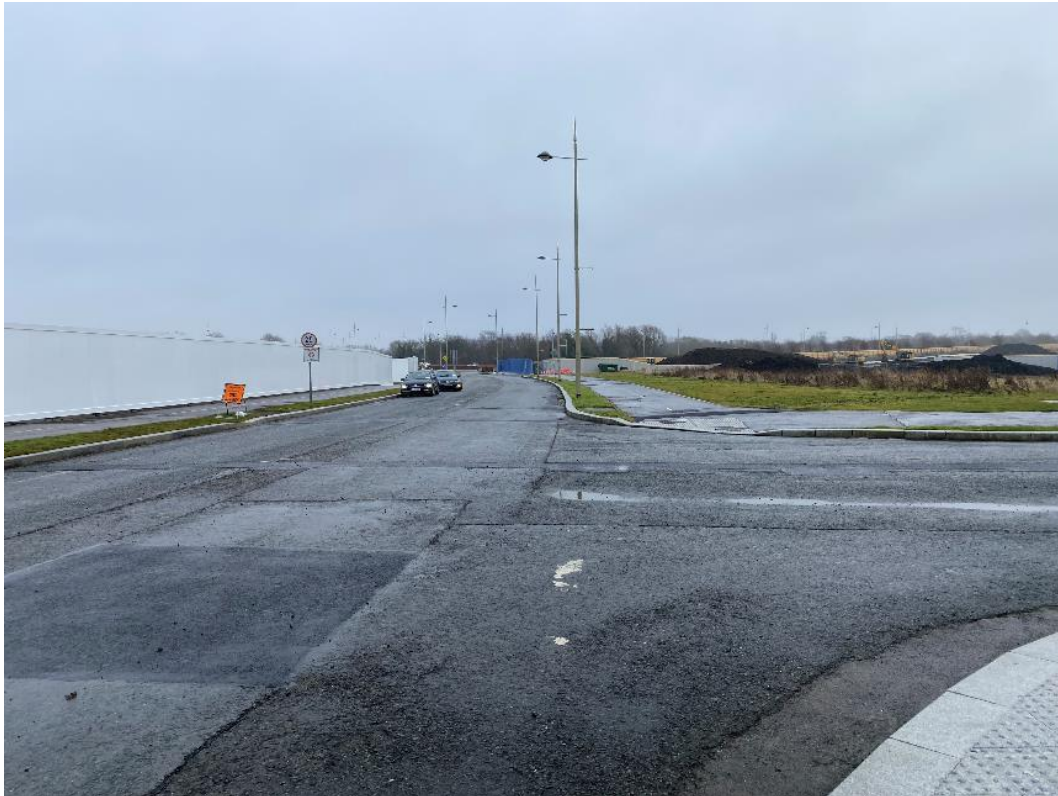
Plate 133-3: Central section of proposed development, facing east