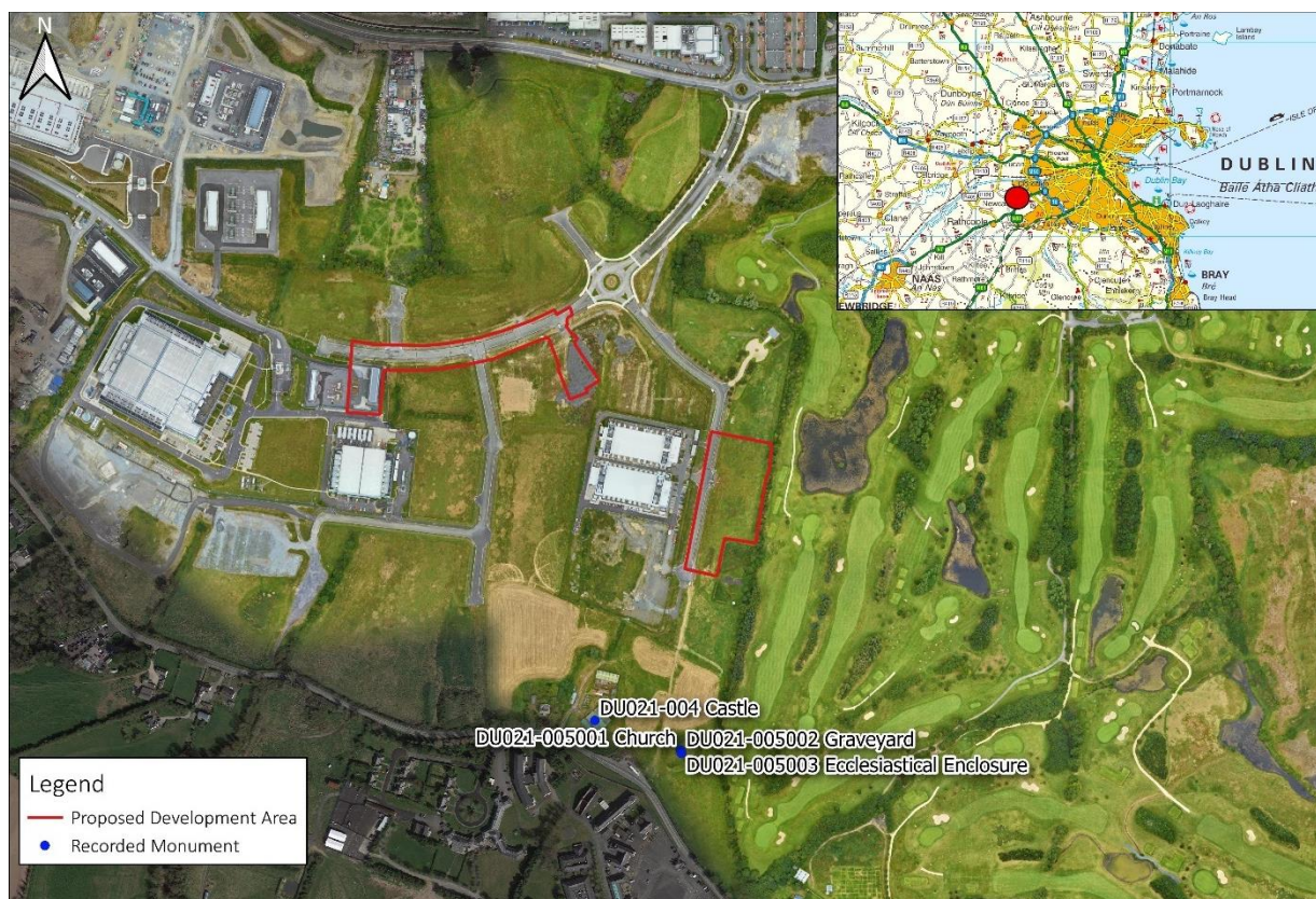
Figure 133-1: Site location showing recorded monuments (Google Satellite)